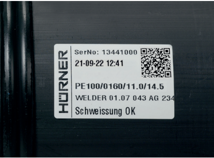
Tag printer and label tags

Immediate quality labeling of every welded joint is possible with the optional dedicated tag printer that delivers an abrasion-proof plastic sticker which can be used as a label on the fitting or joint.