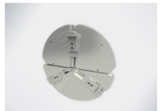
Welding neck support (two-piece)