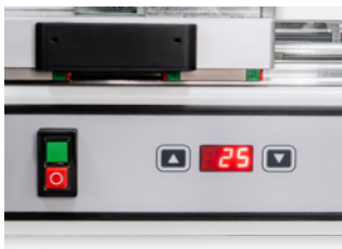
Digital temperature display