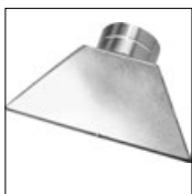
Item No. 4023 Wide slot nozzle 200 x 5 mm, for model 7500