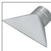
Item No. 4021 Wide slot nozzle 150 x 1 mm, for model 3000, 3000E