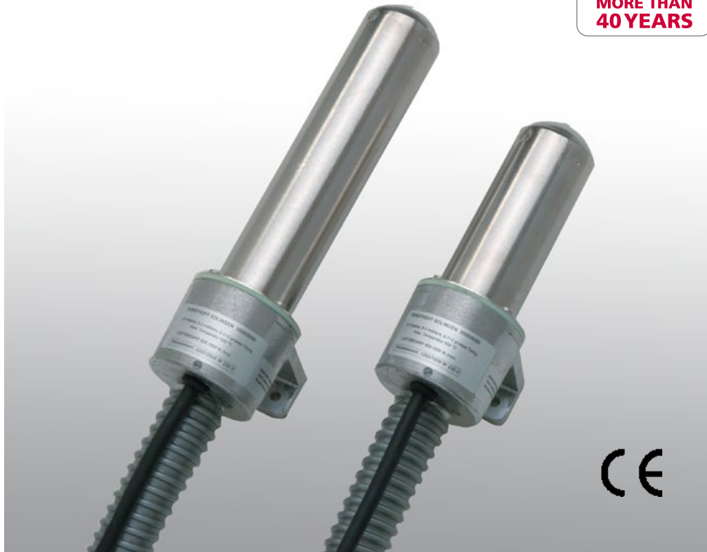
FORSTHOFF air heater Model 3000 and 5000

The uncomplicated and sturdy hot air generator for many applications.