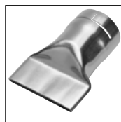
Item No. 4031 Wide slot nozzle 70 x 4 mm