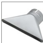
Item No. 4022 Wide slot nozzle 150 x 10 mm, for model 3000, 3000E