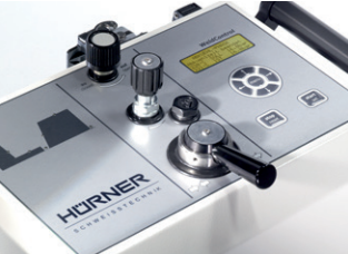
Front panel with GT keypad