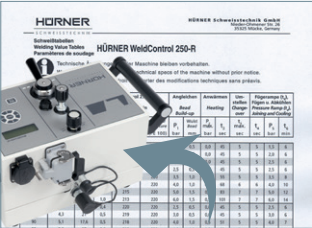
WeldControl jointing – no errors, no welding parameter look-up, but data recording