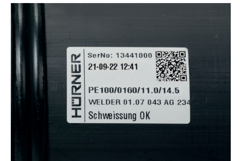
Tag printer and label tags

Immediate quality labeling of every welded joint is possible with the optional dedicated tag printer that delivers an abrasion-proof plastic sticker which can be used as a label on the fitting or joint.