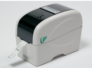
Tag printer and label tags

The HÜRNER movement pushbutton fitted to the basic machine chassis allows moving the machine carriage when the welder stands next to the chassis. This enables convenient welding without constant back-and-forth between the hydraulic and control box and the machine chassis.